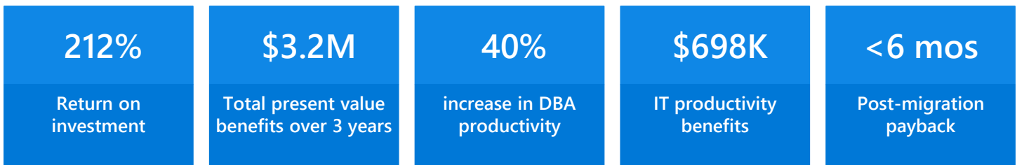
The Total Economic Impact™ of Azure SQL Database Managed Instance, Forrester Consulting, October 2018

It is time to move your data to the cloud. Companies that moved their on-premises and hosted data to Azure SQL Database can see real benefits and cost savings, making Azure SQL Database the most economical destination for your SQL Server databases.